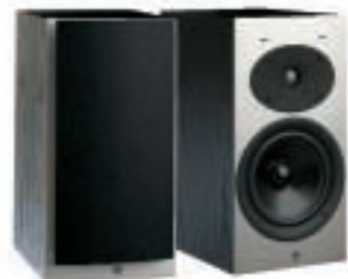
AS-B2 Bookshelf Speakers